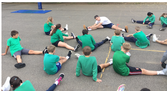
Leading a warm up & stretch before the Y6 workout begins...

He was born with Talipes Equinovarus (more commonly known as clubbed foot) and competes in the Men's T44 classification.