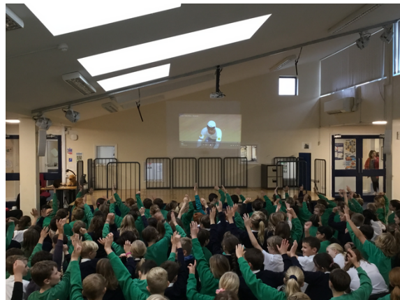
Lots of questions about track racing!